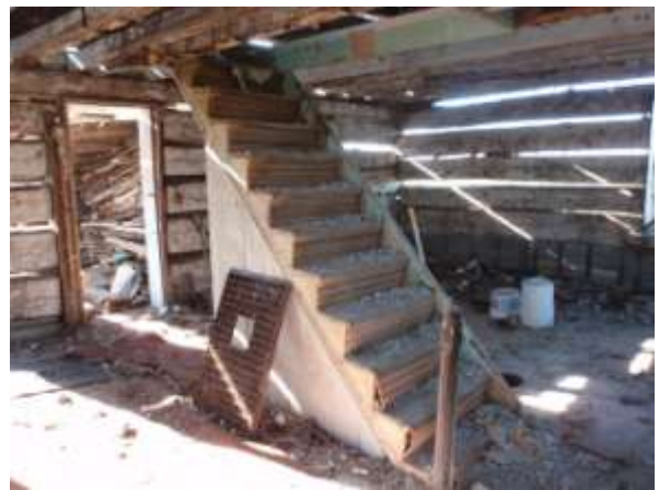
The Morrison 19' x 28'