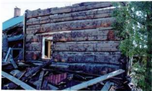
22" Log Faces 19 x 27

2 doorways with original divider wall between (could be modified to one doorway) 2 floors of original flooring 2 wide corner staircases Full pole rafters and ridge board Hemlock all the openings are original except doorway cutout to the main house