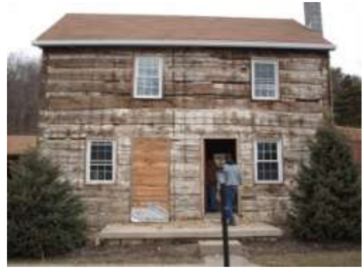
The Mifflin 19 x 26 ½ 1800

2 doorways with original divider wall between (could be modified to one doorway) 2 floors of original flooring 2 wide corner staircases Full pole rafters and ridge board Hemlock all the openings are original except doorway cutout to the main house