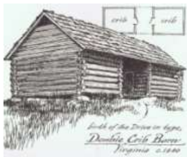
Double Crib Barn