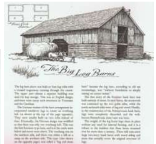
The Big, Big Log Barns