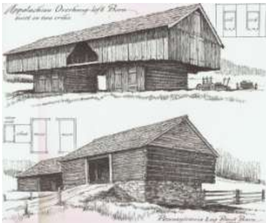
Appalachian Overhang Loft Barn