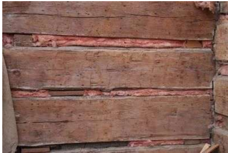
2 Story Dog Trot Cabin 1869 Poplar Dovetail

~~~~~ All of these Individual Buildings are "Resurrection-Ready"!