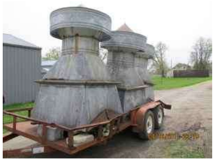
A Trio of Metal Barn Cupolas