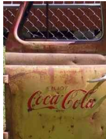
Coca Cola Doors