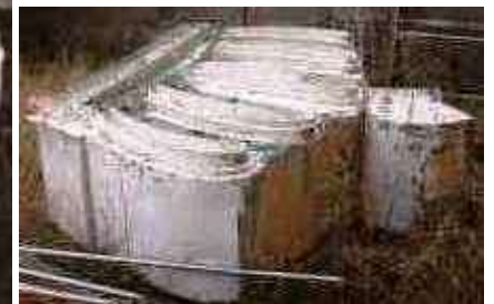
Royal Crown Rotating Sign 6 Ft x 6 FT