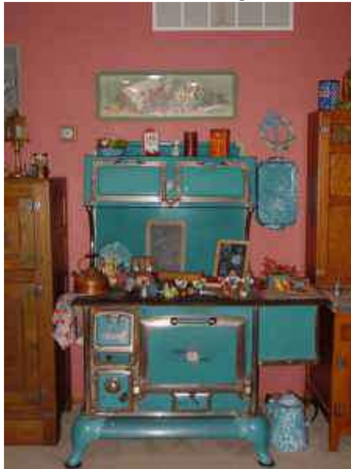
The Quick Meal Wood Stove Water Reservoir and Two Warming Ovens This stove is very much in working order; it is in very good condition