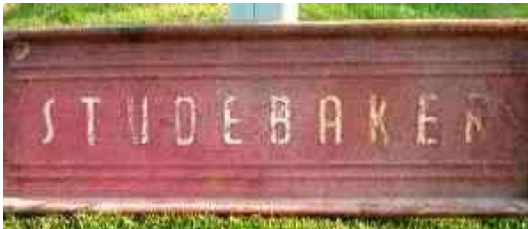
1951 Studebaker tailgate