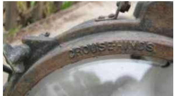
Old Prison Spotlight, patent date March 23, 1909 Maker Crousehinds lens is in perfect shape, with no cracks In working Condition but rewiring would be in order