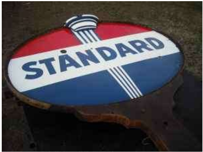
Standard Oil sign 18ft tall top of sign is 8 x 4, this is in excellent condition