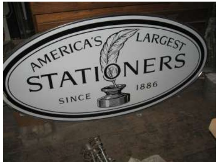
America's Largest Stationers 5'

Don't see what you want? Get in touch with us and we'll source things for you!