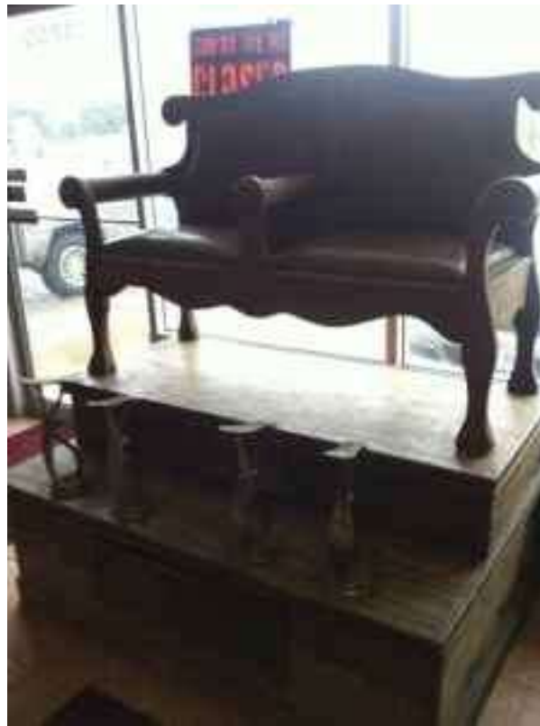
Wood and leather Shoe Shine Stand