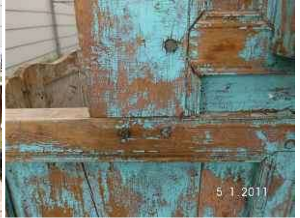
Confessional Booth came from old church in New Mexico Wooden pegs, no nails used Spanish Colonial period