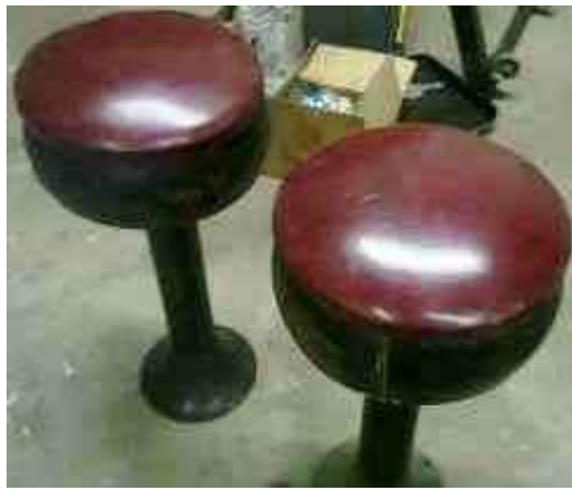
22 available-cast iron bases Seats are in excellent shape.