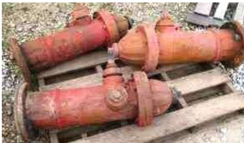
Fire hydrants - six available