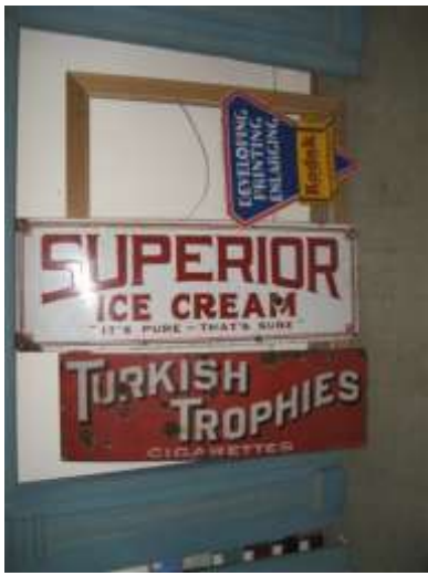
Ice cream 40x14 Turkish 37x12 Kodak 16x17