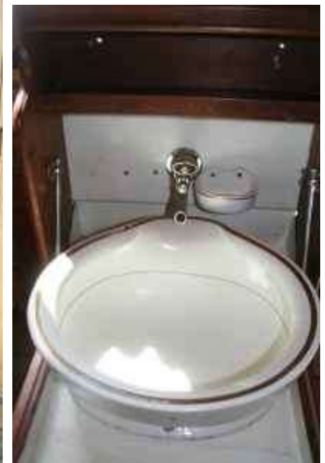
Fold-away yacht bathroom sink and cabinet 1880's era.

Cabinet attaches to wall for stability Ceramic sink and basin with soap holder