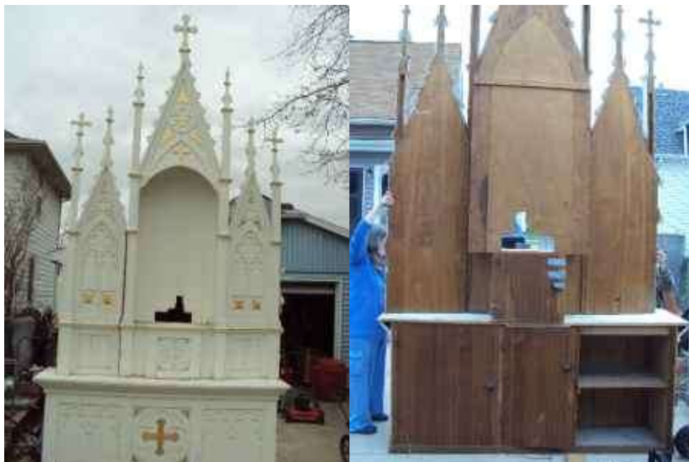
A church Altar 16ft tall x 8ft wide x 36" deep, very ornate