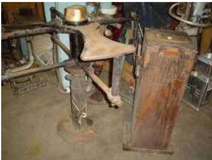
1913 Turnstile and Ticket Box by H. V. Bright

19-20" high in the center and about an inch or two less in height along the hinge side Overall they are about 24-27" wide and have a 1-1/2" profile from front to back They are complete with turn latch and hinges, without any breaks.