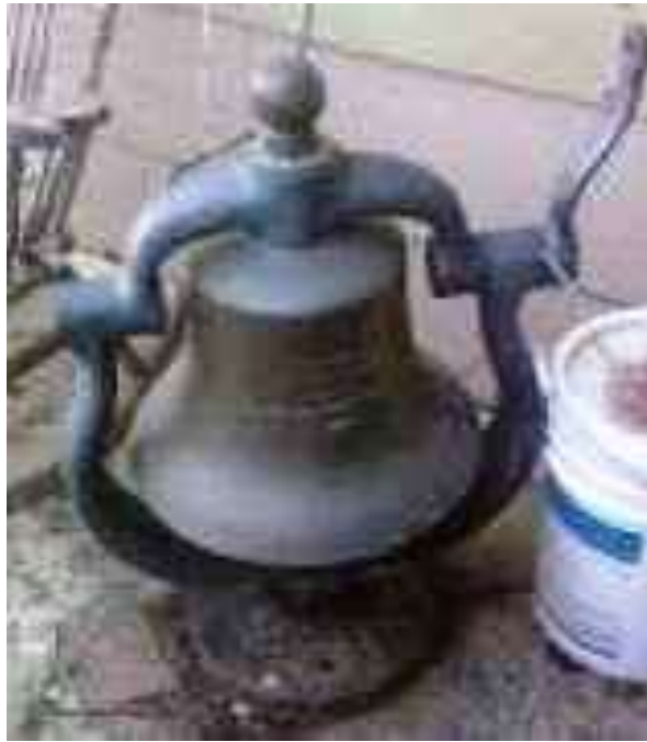
Locomotive Train Bell