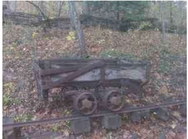
A couple of old railroad carts that come with 30-35 ft. of track to set them on