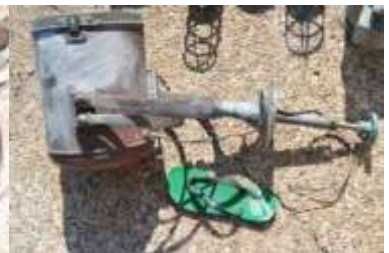
Navy Spotlight all brass fixture, came off of Lionel Liberty ship