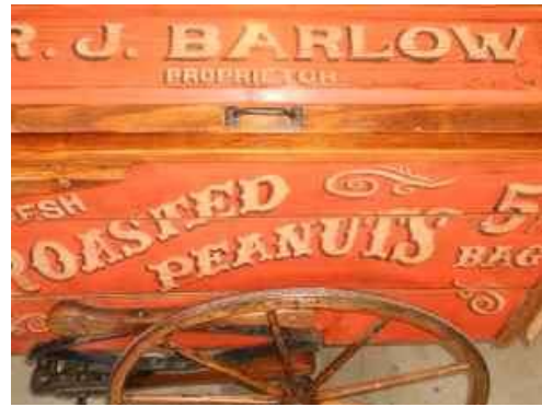
Peanut Hand Cart All wood, wheels, and handles are in excellent shape Both sides of the top open up for easy access 1910-1920