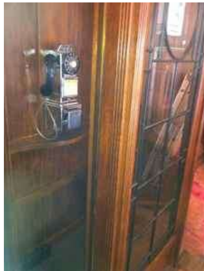
Phone is ready for hook-up still works, cabinet made of 1/4 sawn oak with leaded glass