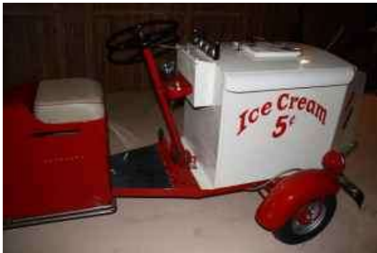
Ice Cream Scooter

2 of three kegs are refrigerated with slide out unit to store or attach wine bladders or mini keg. 38" high....42" wide