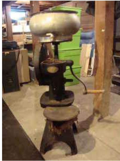
1930's-40's McCormick-Deering cream separator. In good shape, just needs a cleaning.