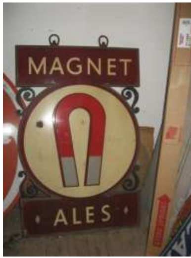
Magnet Ales 48x30" 2 sided English