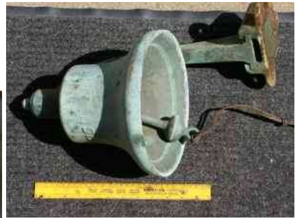
US Navy Cast Bell