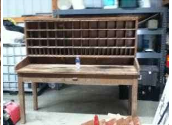
Mail Sorting Table solid oak 64" height, 34" from floor to table top, 26" depth on working area 70" across side to side